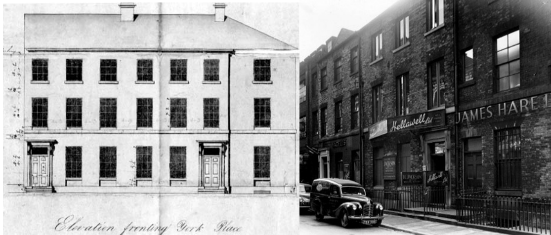
Nos 10-12 York Place; the original design and in a photograph of 1955

7.2 The smaller size of Nos 17-20 and 22 illustrates the declining status of the Park estate, which was losing its richer inhabitants, first to Little Woodhouse and then to Headingley. The gentry, professional classes and rich merchants for whom it had originally been conceived would be replaced by inhabitants engaged in trade and the houses subsequently used for purely business purposes. No new large houses would be built and the areas of the estate which had not been successfully developed would be filled up with back-to-back housing of the workers of Park Mill and other industries, as can be seen on the OS map of 1905. Much of this housing survived until the middle of the 20 th century.